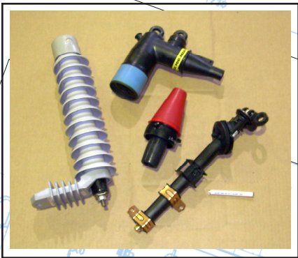
Components & Protective Equipment